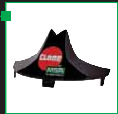
CUSTOMIZED FRONT PLATE