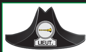
XF1 Front Plate, Lieut. w/1 trumpet (GA1150-N4)