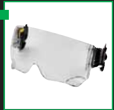
INTEGRATED OCULAR VISOR