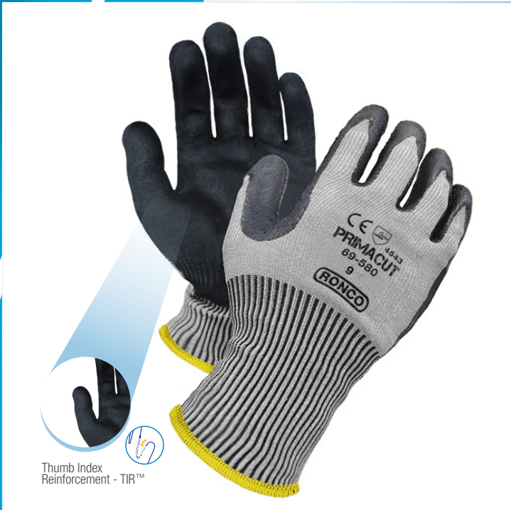
Thumb Index Reinforcement - TIR™