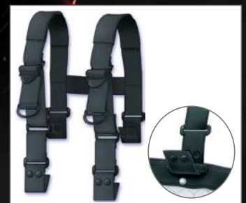
PADDED H-BACK RIPCORD SUSPENDERS attach to horizontal loops so there is no hardware to dig in or pull out.