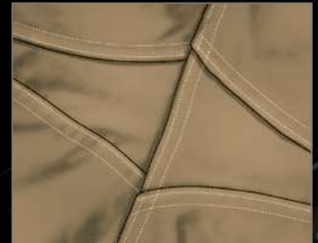
DIAMOND CROTCH GUSSET distributes stress in both shell and liner for durability.