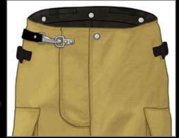
VERTICAL FLY with hook and dee positive closure and take-up straps or optional belt.