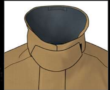
FREE-HANGING THROAT TAB stays out of your way when not deployed.