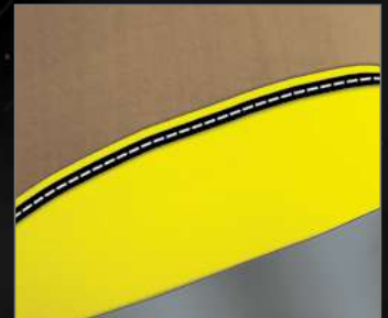
TRIMTRAX ® THREAD PROTECTION cording lasts far longer on sewn on trim than conventional stitching.