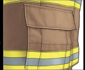
DUAL-ACTION CARGO POCKETS with KEVLAR ® fabric reinforcement inside.